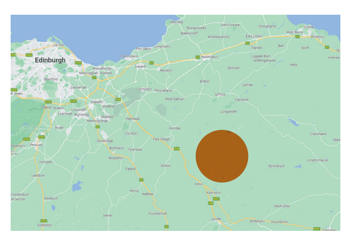
Approximate location of wind farm site (for illustrative purpose only)

Turbine technology has continued to advance considerably and new onshore wind projects like the proposed Longcroft Wind Farm are amongst the lowest cost forms of generating electricity. These modern, taller turbines generate significantly more electricity which will help to address the climate emergency, cost of living crisis and security of energy supply issues that we currently face. If consented, Longcroft Wind Farm would be capable of generating clean, low-cost renewable electricity for around 110,000¹ homes – helping to play an important role in meeting Scotland's legally-binding 2045 net zero target.